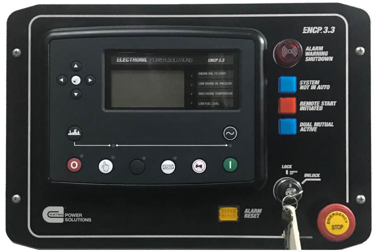
Image for Illustrations Purposes Only, Your Actual Product May Vary

Discover more at electronil.com/encp_3.3